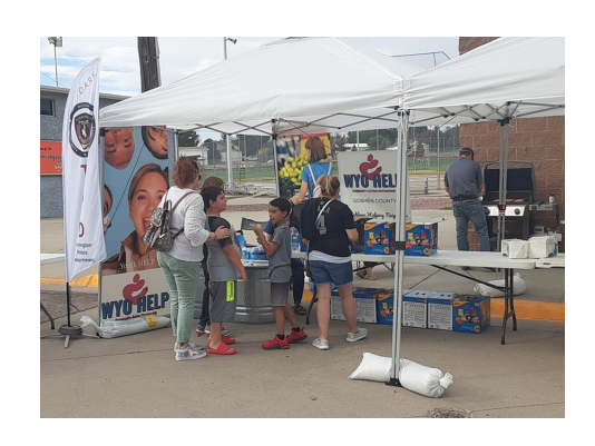
National Night Out in Torrington