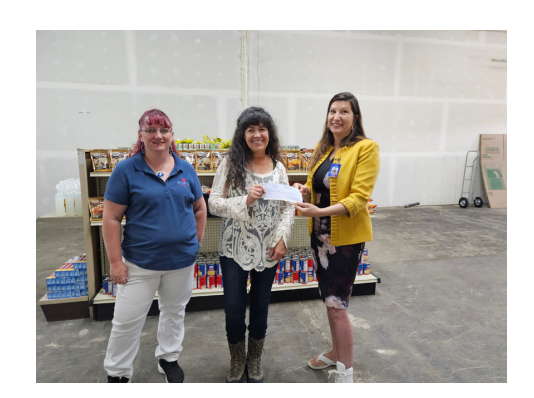
Rawlins Food Pantry Opened