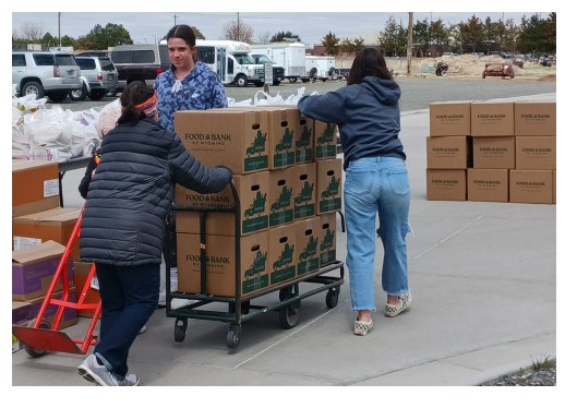
Mobile Pantry in Torrington