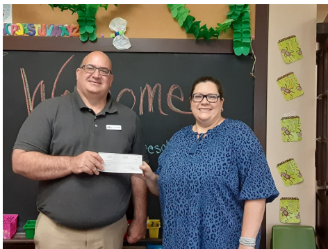
Grant to preschool