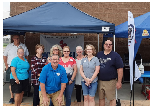
National Night Out